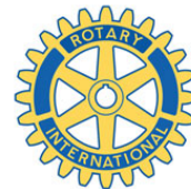
Beverly Rotary Club